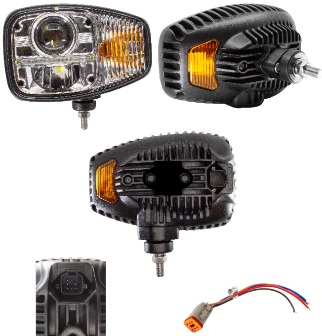
Close-up image of 6-way DT compatible receptacle